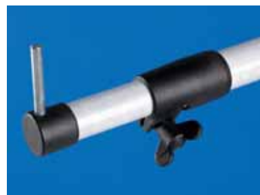
Strong adjusting clamp for maximum tension.

All the main frame angles are manufactured in a specially reinforced material that has been designed for maximum strength. The adjusting clamps are simple to adjust in order to obtain maximum tension.