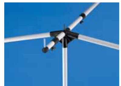
Reinforced frame angle in a modern design.